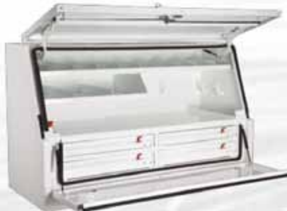
XTREME OFFSIDER IV

NOTE: ALSO AVAILABLE AS SIX DRAWER MODEL