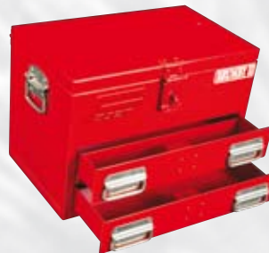
BRUMBYII NOTE: DRAWER DEPTH IS 60MM