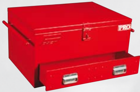
PRO NOTE: DRAWER DEPTH IS 110MM