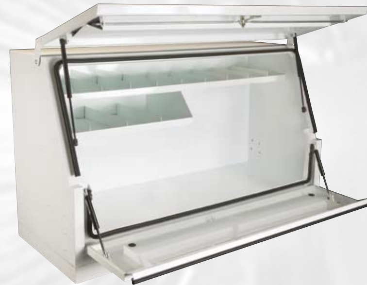
XTREME DROPSIDER NOTE: ALSO AVAILABLE IN 1200L