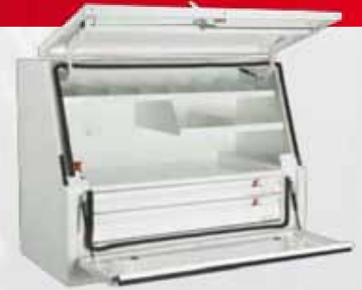
XTREME DROPSIDER II

NOTE: ALSO AVAILABLE AS ONE DRAWER MODEL