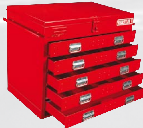
HERCULES V NOTE: STANDARD WITH FORK LIFT SLOTS