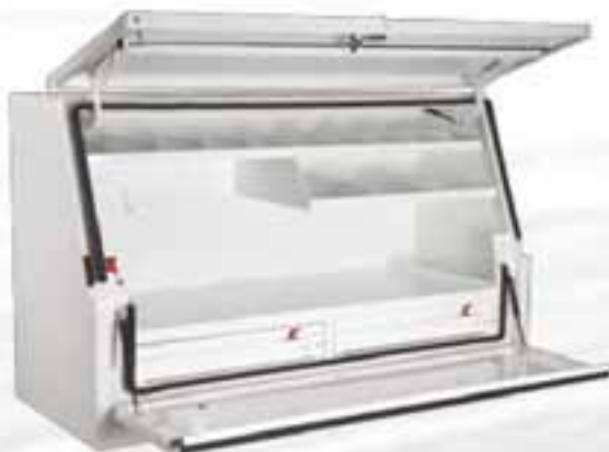
XTREME OFFSIDER II